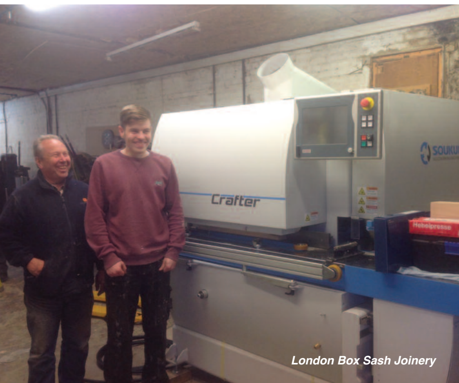
London Box Sash Joinery