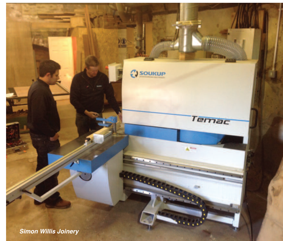
Simon Willis Joinery